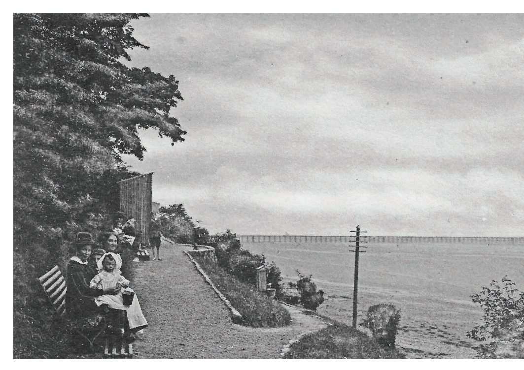
The Banks, Bowness-on-Solway

For further information on the Remembering the Solway project, including transcripts and extracts from the audio recordings of the interviews, visit www.solwaywetlands.org.uk